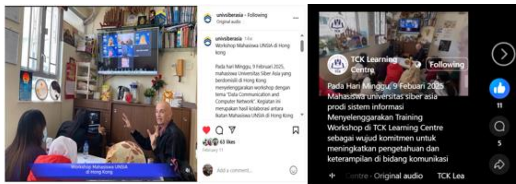
Figure 3. Publication of activity results

The results of this activity's development show a significant positive impact on the participating participants, including: The speakers providing the training materials have relevant competencies, the training held at the TCK Learning Centre, Hong Kong, used a hybrid method (onsite and online) to reach participants in different locations (Indonesia - Hong Kong), as shown in figure 2, publication on news media portals: Instagram of Universitas Siber Asia, Facebook of TCK Learning Centre Hong Kong, as shown in figure 3.