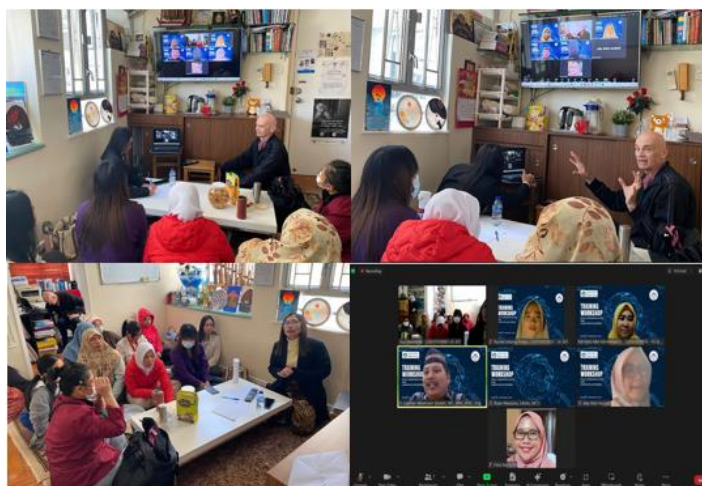
Figure 2. Hybrid training activities Indonesia – Hong Kong